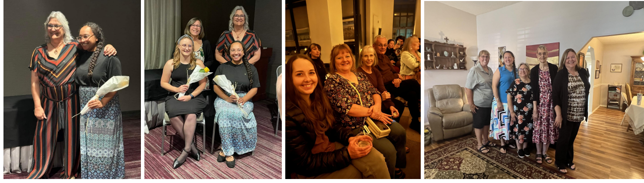
Our 2 new pledges and big Sisters

Happy Holiday and Happy New Year to all our DTC sisters. We hope to see you in 2024!