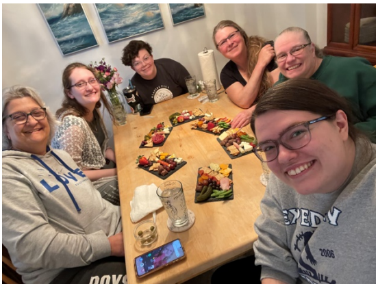
NEBRASKA ZETA CHAPTER